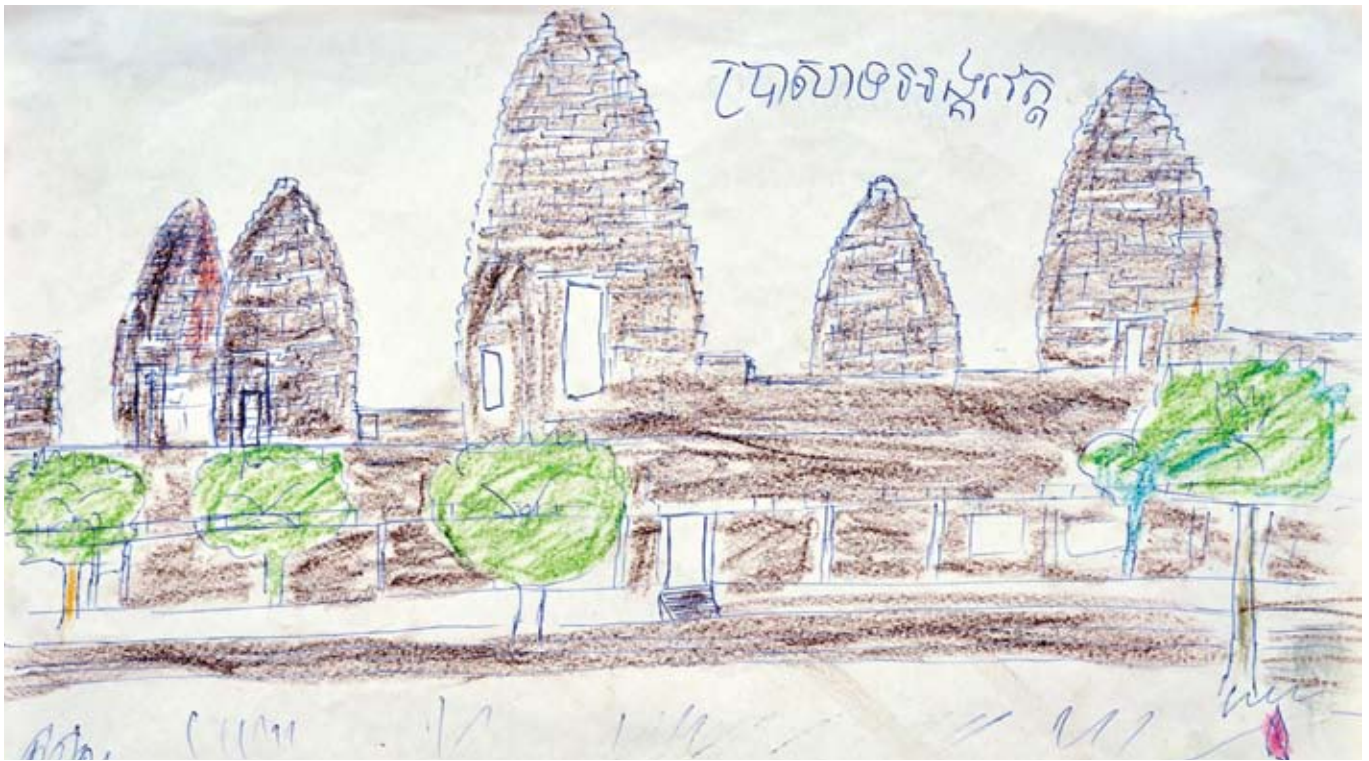
Angkor Wat Temple